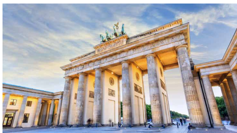
Berlin's Brandenburg Gate.