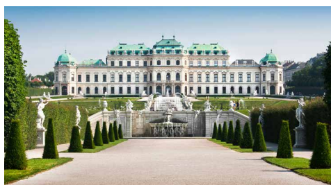
Belvedere Palace in Vienna.

Following our final breakfast at the hotel, the tour concludes.