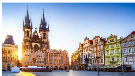
The Old Town Square in Prague.