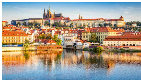
A view of Prague and St Vitus Cathedral.