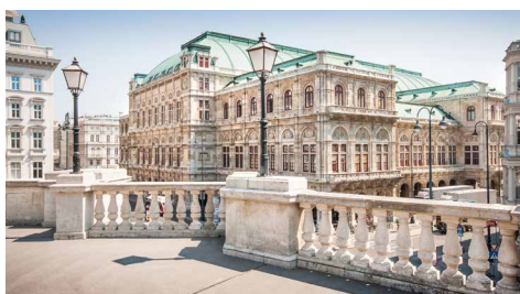
The Vienna State Opera.