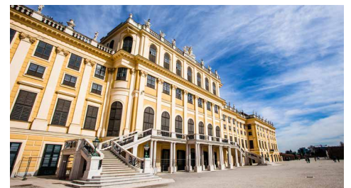
Schönbrunn Palace in Vienna.