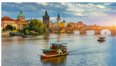
The Charles Bridge and the Vltava River.