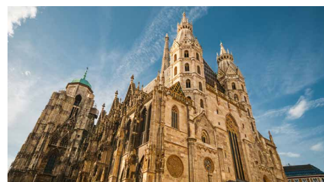
St Stephen's Cathedral in Vienna.