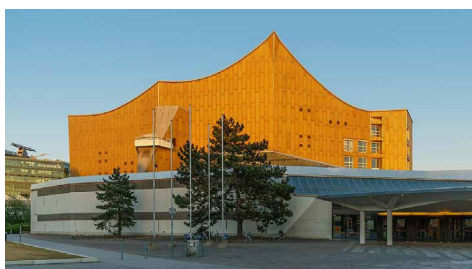
The Berlin Philharmonie.